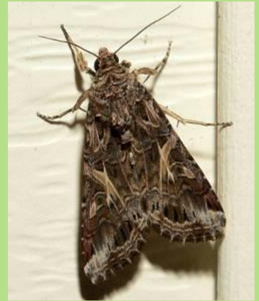
Yellow striped armyworm