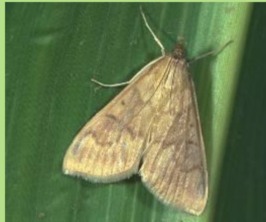
European corn borer ♀