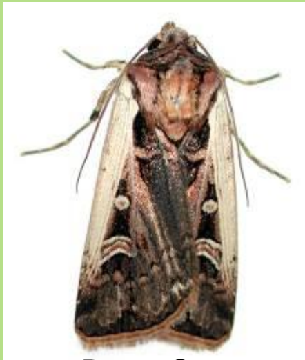
Western Bean Cutworm